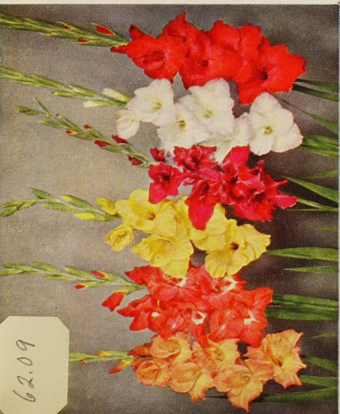
B. Duncan, Boldface, Gold, King David, Columbia, Poinsettia